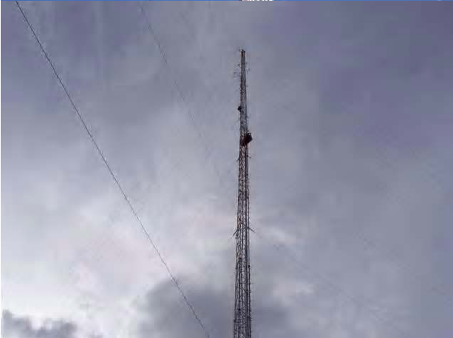
505' Guyed Tower, Global Signal ~ Lino Lakes, MN